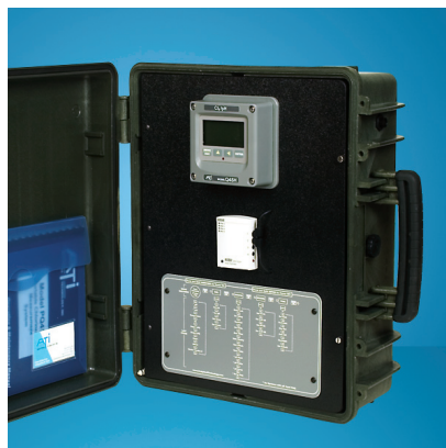
PQ45 Portable PAA Data Logger