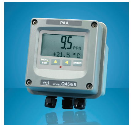
PAA Loop-Powered Transmitter