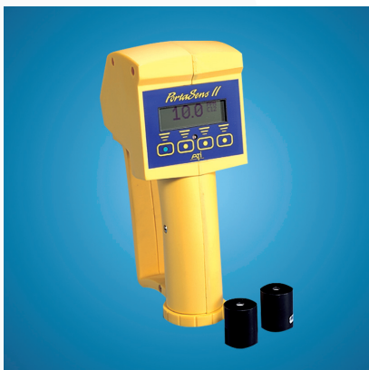
Toxic Gas Detector

ATI also offers a loop-powered dissolved peroxide monitor for those applications where extra outputs and/or relays are not required. A battery powered portable unit is also available with an internal data logger for temporary monitoring applications. And for safety around your peroxide system, ATI manufactures a variety of portable and fixed point gas detectors.