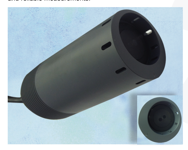
Submersible Turbidity Sensor

ATI's Q-Blast option provides the ideal answer for submersible turbidity applications such as wastewater effluent. Employing a unique "air-blast" cleaning method, sensors can be cleaned as often as necessary without operator attention. Pulses of pressurized air delivered through a nozzle at the tip of the sensor remove accumulated solids from critical sensing surfaces, resulting in accurate and reliable measurements.